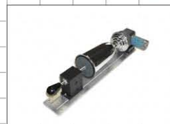
Accessories that Fit [Servo & Stepper]