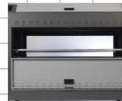
"Pass-Through" Capability [13x25 7 24x36 Work Areas]