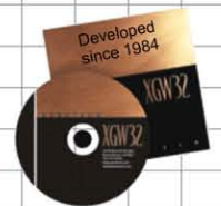
Feature Rich, User Friendly XGW32 Software