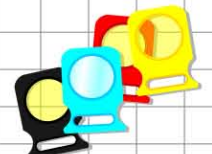
Remove & Replace Mirrors Without Realignment